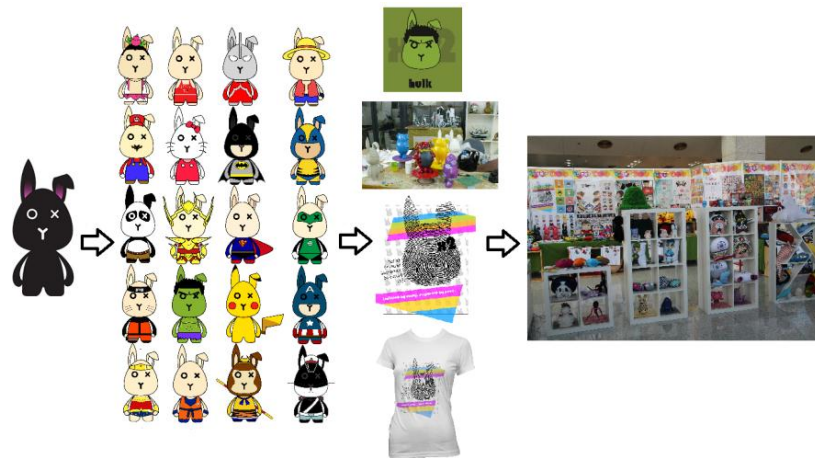
Figure2.Comics Design Course: Conceive, Design, Implement and Operate

prize in Teaching Achievement Award of Higher Education in Liaoning Province in 2012, which reflects the innovation, applicability and operability of this talent cultivation model.