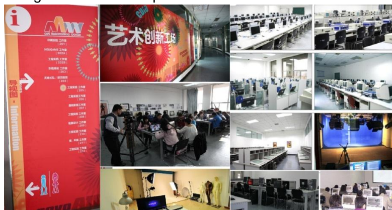
Figure3.Digital arts practical teaching base cluster

To fulfill the requirements of TOPCARES-CDIO’s engineering practice, we have established a provincial-level practical digital arts teaching base cluster as illustrated in Figure3, which is composed of professional studios, professional laboratories, virtual companies and external companies. So far, we have set up 16 professional studios according to the real enterprise environment, including digital video, digital animation, digital games, digital painting, and so on. And we also built 14 professional labs, including sculpture, 2D animation, digital animation, stop-motion animation, digital printing, non-linear editing, photograph, etc., as well as 7 internal virtual enterprises and more than 20 external enterprises practice bases. The existing engineering practical context can fully satisfy the practice teaching needs of more than 1,800 undergraduate in the department.