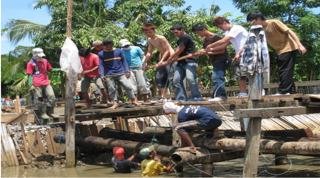
Figure 5: Lifting of logs for propping of bridge deck

The students found this stage to be exciting as it gave them the opportunity to put into practice some of the civil & structural engineering knowledge that they had learned over two years in the Diploma in Civil & Structural Engineering course. Especially relevant were construction technology and reinforced concrete design. The students were also able to differentiate between the method of construction adopted on this project, in a rural setting, versus similar projects in Singapore especially in areas such as the use of machinery, manpower and safety. As the students were working alongside the contractor's workers and other SPUP students, there were also occasional frustrating moments due to the language barrier although this did not pose much of a problem as they were, by then, sensitized to their working environment. Further the close guidance and encouragement from the staff served to motivate the students.