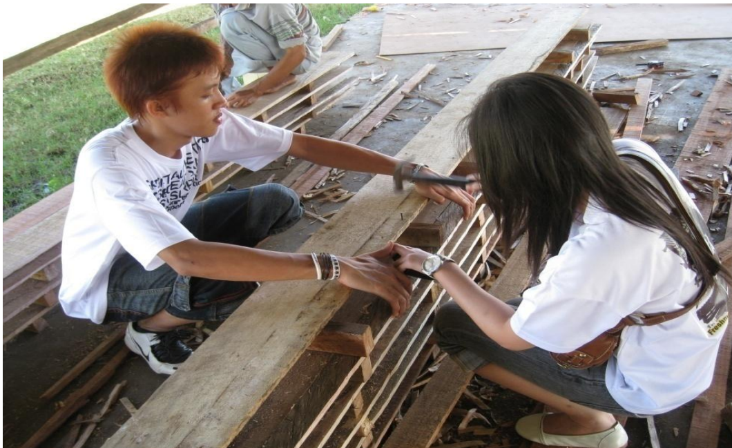
Figure 4: Nailing of formwork

The cost of construction was around Rp 83,000,000 (S$12,969). Singapore Polytechnic contributed S$5000 to fund the project.