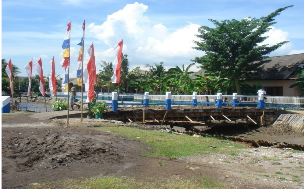
Figure 6: Completed reinforced concrete bridge