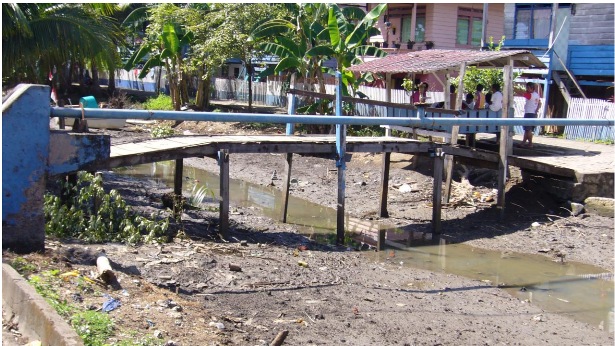
Figure 2: View of Existing Timber Bridge in Nelayan Village