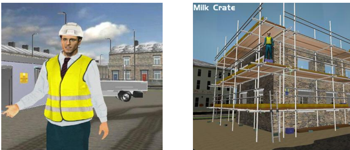
Figure 2 Construction site health and safety virtual reality package

Before the Constructionarium week, students are engaged with a number of lectures, interactive exercises, coursework and formal induction to raise their awareness of health and safety on construction sites. An interactive virtual reality computer package [3, 4] is introduced in which students are encouraged to explore a fictitious construction site and identify hazards and their associated risks, Figure 2. As part of the preparatory coursework each student researches the real full-size structure on which their Constructionarium project is based and must report on the construction procedure and any associated health and safety issues. Immediately before the Constructionarium week, the collaborating Contractor presents a Health and Safety induction, which is a legal requirement before any site activities can be permitted. In addition the National Construction College has its own Health and Safety induction video, which all the students must watch.