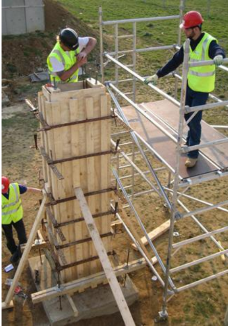
Figure 10 Working at height