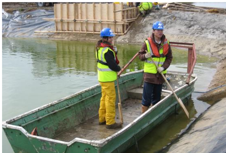
Figure 4 Use of flotation gear