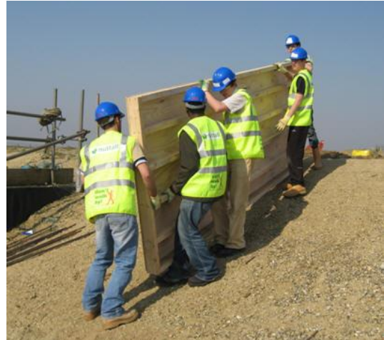
Figure 7 Manual lifting