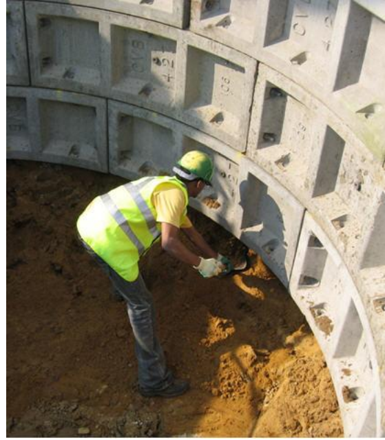
Figure 11 Excavation work