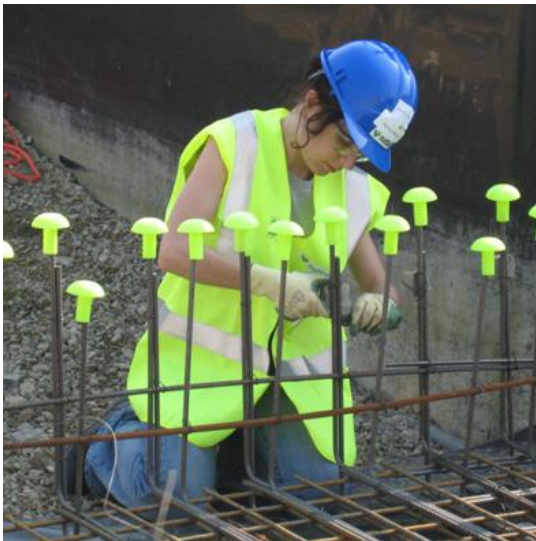
Figure 8 Steel-fixing