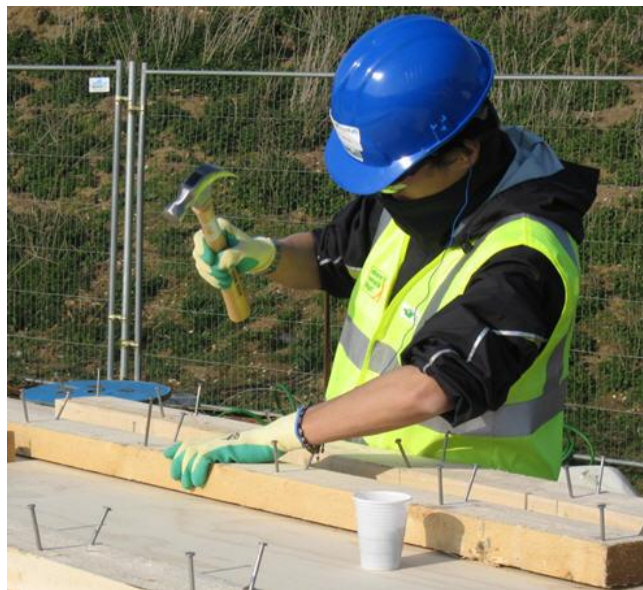
Figure 5 Student with PPE using hand tools

Five or six members of each student team are selected to become "power tool operators". These are students who will use petrol or electric powered tools such as a timber rip saw, steel/masonry cutter, drills and grinders. The students are given basic training and issued certificates by the National Construction College to ensure that they can use these tools safely. Following this training, these are the only students permitted to use any power tool for the rest of the Constructionarium week. They are identified by a bright coloured helmet sticker, which ensures that supervisory staff can control the safe use of power tools. However, hand tools such as hammers, saws and shovels can be used by any student, Figure 5.