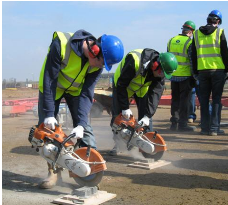
Figure 3 Students with appropriate PPE using power tools

Personal protection equipment is provided partly by the students themselves and partly by the Contractor. All students must purchase their own steel toe-capped safety boots for use on site. The contractor provides high visibility jackets, construction helmets, safety eyewear and rubberised cotton gloves. These must be worn by every student at all times while on site. In addition for further activities some specialised PPE is required and supplied. Wood or steel cutting operations involving dust and noise are carried out by students wearing a suitable dust mask and goggles, together with ear defenders, Figure 3. Operations over water are carried out by students wearing personal flotation safety equipment, Figure 4.