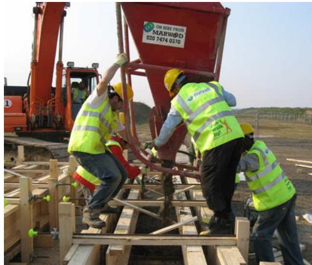
Figure 9 Concreting