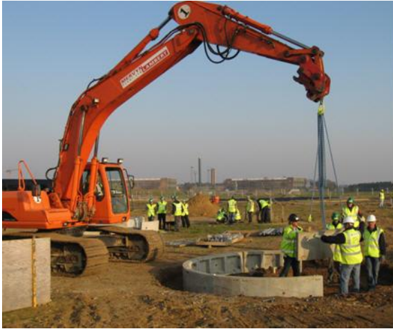
Figure 6 Working with construction plant

excavations, Figure 6. Manual lifting of heavy items has been carried out using sufficient student numbers and correct lifting procedures, Figure 7. Potential injury has been avoided during steel-fixing by using the correct procedures, PPE and safety caps on all steel bar ends, Figure 8. Students have worked at height using suitable safe access facilities, Figure 9 and have worked with corrosive materials (concrete) using correct training and PPE, Figure 10. Students have worked safely with ground excavation using appropriate construction procedures, Figure 11.