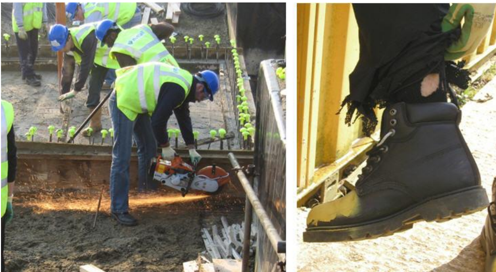
Figure 12 Cutting using steel-saw