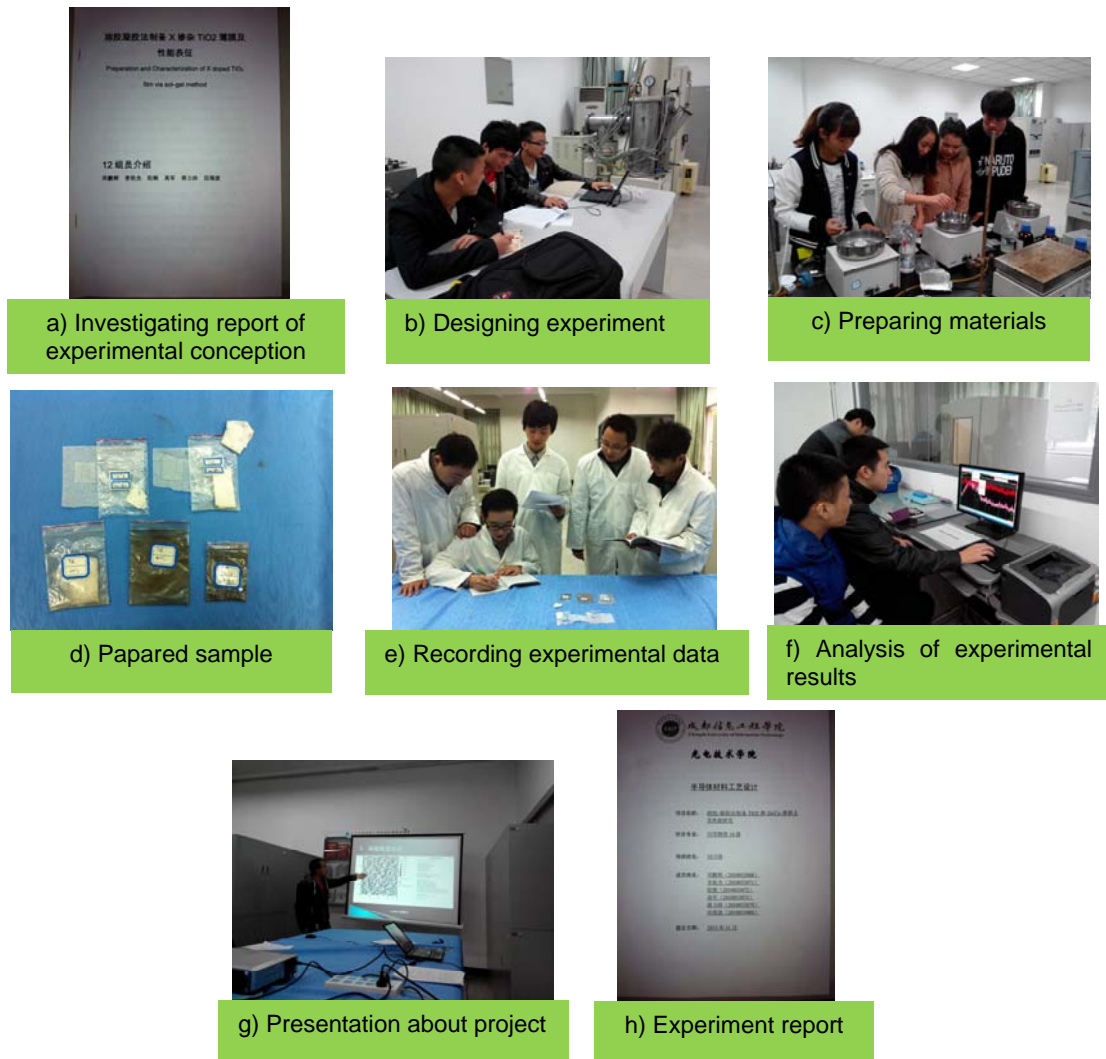
Figure 1. Active Learning in CDIO practice course

Guiding by the integrated design of course and self-management model, students have carried out an active learning during SCPM course, and their skills about knowledge application and teamwork have been fully practiced. The process of their learning and the outcomes of teams are shown in Figure 1. This kind of learning is met the needs of the CDIO 7 th and 8 th standards.